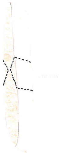
Diagram 1: Compressed Sponge